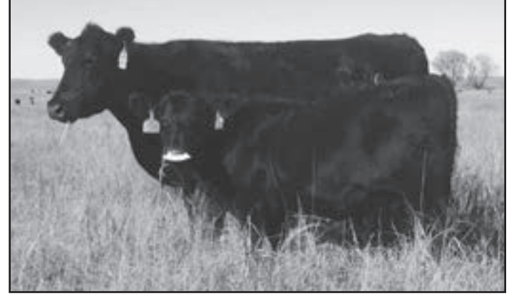
SVR FIRST CALF HEIFER PAIR

COW BULL prospect, 5155 is a full brother to SVR senior herd sire "SVR Range Master 1175." Both of them were part of a 2010 flush. His mother, the 604 cow, is one of our most productive donors. His full siblings have been extraordinarily well received in the commercial market and his sisters have stayed in our herd. Flush brother to 5127.