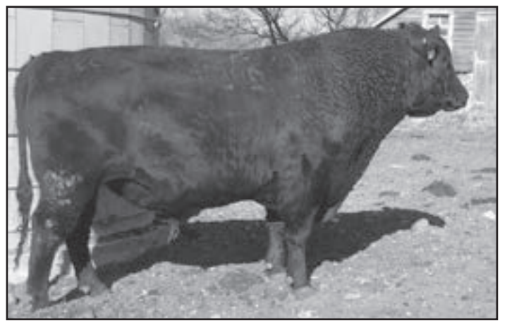
SVR RANGE MASTER 2054

HEIFER BULL prospect. His mother is a no miss cow; moderately-framed, good-uddered, gentle, and easy to calve. One of her sons has been sold at our sale, and she has several daughters in production at the ranch.