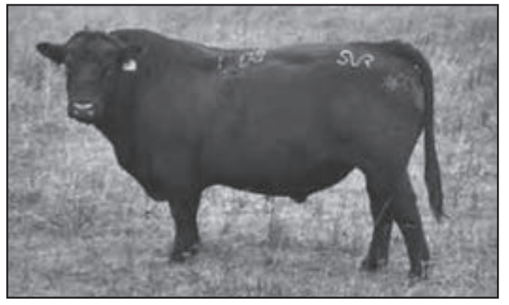
SVR RANGE MASTER 0108

O including one by Lodge of Wye, a 7/8's brother to 5149's sire, Federal. Another son of 9141, by Fabron of Wye, tied for higher seller in our 2015 sale and is working hard in Burkes Garden, Virginia. Don't miss this bull.