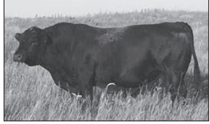
SVR RANGE MASTER 1201

N/A I-1.8 I+19 I+25 I+10 I+37.04 63 HEIFER BULL prospect, has a proven pedigree backed by longevity and fertility. His maternal grandam, SVR donor 542, is still in production at 12. 5168's dam has a full brother who is one of our herd sires. 5168's sire is the product of the proven Lodge of Wye mating with our 04F3 cow. This pedigree gets results.