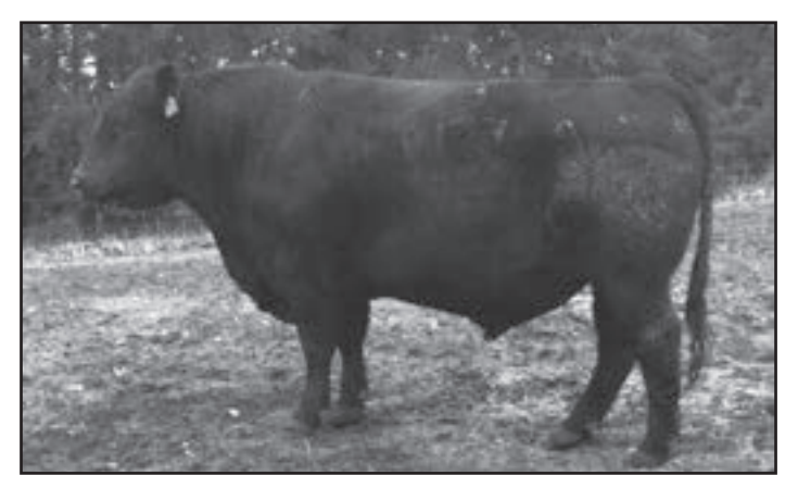
SVR RANGE MASTER 0127

HEIFER BULL by 6V47 out of a double-bred Viking GD60 cow. 5129's dam has a maternal brother sired by Candolier Forever 376, SVR Forever Edda 4110, who is working at Bumgarner Angus Ranch in Montana. 5129 will make long-lived, fertile females. He's a full brother-in-blood to Lot 5129.