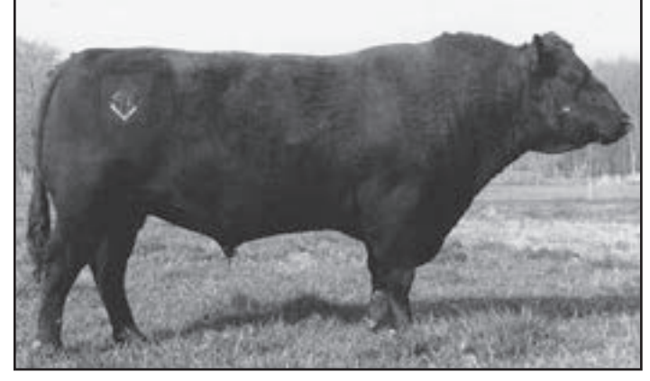
BEAR OF WYE UMF 6591

HEIFER BULL prospect that should ensure easy calving and efficient cattle. We are really happy with the consistency and production of both bull and heifer calves produced by crossing Yancey and Beeler.