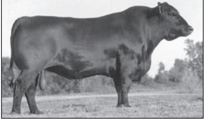
PARAMOUNT AMBUSH 2172

HEIFER BULL prospect and natural calf sired by 6V47 out of donor dam 542. 542 has had several really nice bulls in past sales, which have made several cattlemen very happy. At age 12, 542 now has daughters producing sale bulls, which demonstrates the strength of her lineage. One of 542's sons is an SVR herd sire, SVR Range Master 2066.